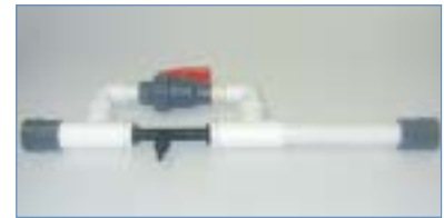
Mazzei® Injector Assembly